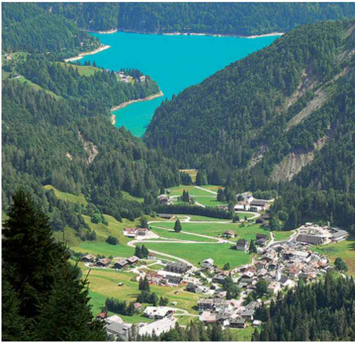
Eastern Alps, Friuli Region - Sauris and its lake.