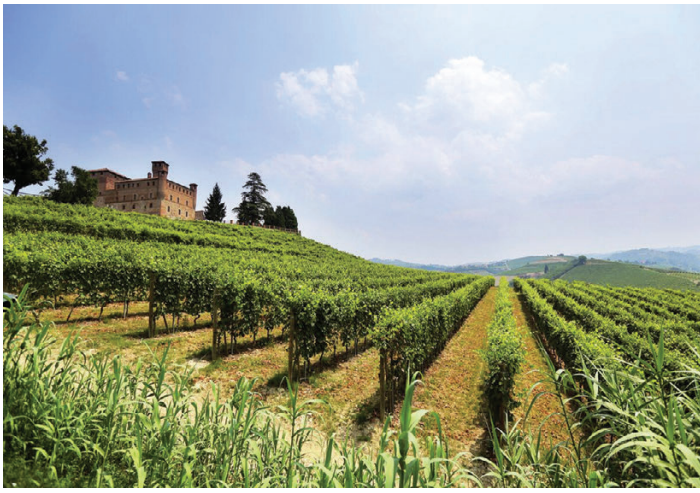
Vineyards and Castles in the Langhe district