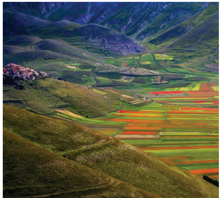
Castelluccio and its plateau at 1,500m

Tue 14 May 08.30 – Full day scenic drive throughout the central part of the Marche Region. 10.15 - Stop and sightseeing at Montefalcone, set on a cliff with sweeping views over the Marche countryside. Continuation through the spectacular Presta Pass (1,550m) and onto Castelluccio, an impressive medieval village on top of a peak. 13.00 - Arrival in Visso, an ancient medieval town boasting an impeccably preserved architecture. 15.00 - Departure for Macerata. 16.45 - Arrival back in Macerata. 19.30 - Optional dinner.