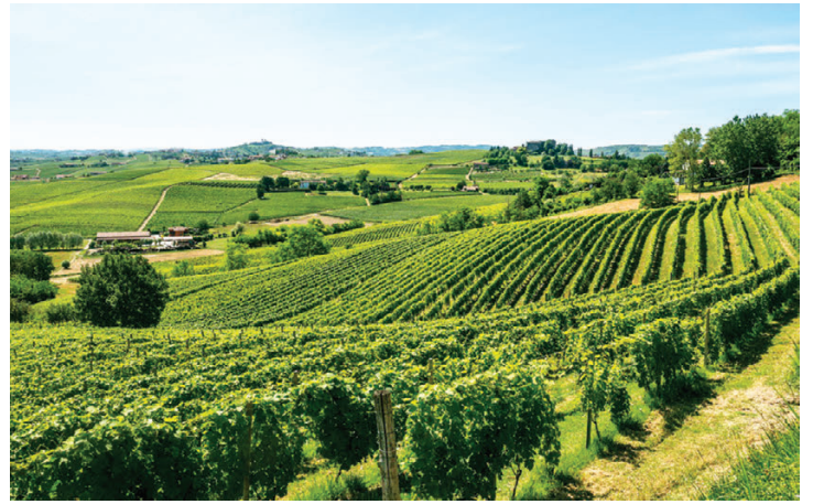
Piedmont Region: Asti and its typical countryside (Monferrato District)

Fri 31 May 8.30 – Departure for Asti, a famous city of the Piedmont Region, well renowned for its wine production. But it is also a gem of Piedmontese architecture and well worth a visit. 09.30 – Arrival at Asti, local orientation and time at leisure. 13.30 – Departure for a scenic drive through the Monferrato District of Piedmont with a refreshment stop in a charming setting. 17.30 – Arrival back in Alba. 19.30 – Optional dinner.