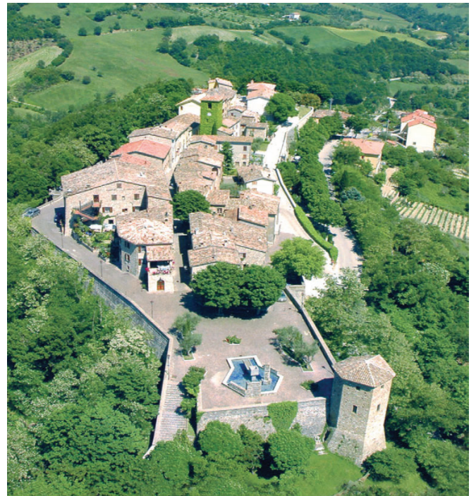
Frontino – Marche Region

Thu 16 May 08.30 – Departure for Ferrara, a UNESCO world heritage medieval city graced by a beautiful XIV century castle, surrounded by a moat and drawbridges. This drive takes you throughout some of the most beautiful unspoilt districts of the Marche Region. Stop and sightseeing in the picturesque medieval village of Frontino located in splendid isolation at 500m on top of a hill overlooking a scenic undulating landscape. Lunch at nearby picturesque Monastery of San Girolamo. Continuation towards Ferrara. 18.00 – Arrival in Ferrara. 19.30 – Dinner in local restaurant (included).