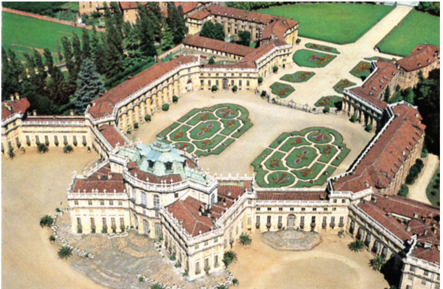
The Royal Palace of Stupinigi was the summer residence of the Savoia family, sovereign rulers of Piedmont

Thu 30 May 8.30 – Scenic drive to the ancient Abbey of Sacra St. Michael, a most impressive building built on a peak of 1,000m with sweeping panoramic view of the Alps. After local visit, continuation to Lake Avigliana and lunch in picturesque restaurant on the banks of the lake.