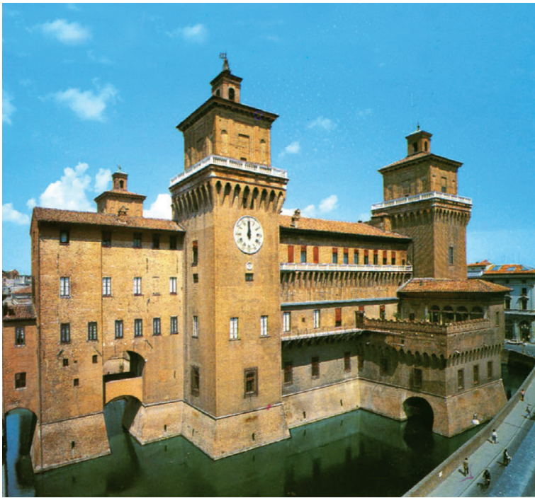
The Castle of Ferrara, a UNESCO World Heritage City