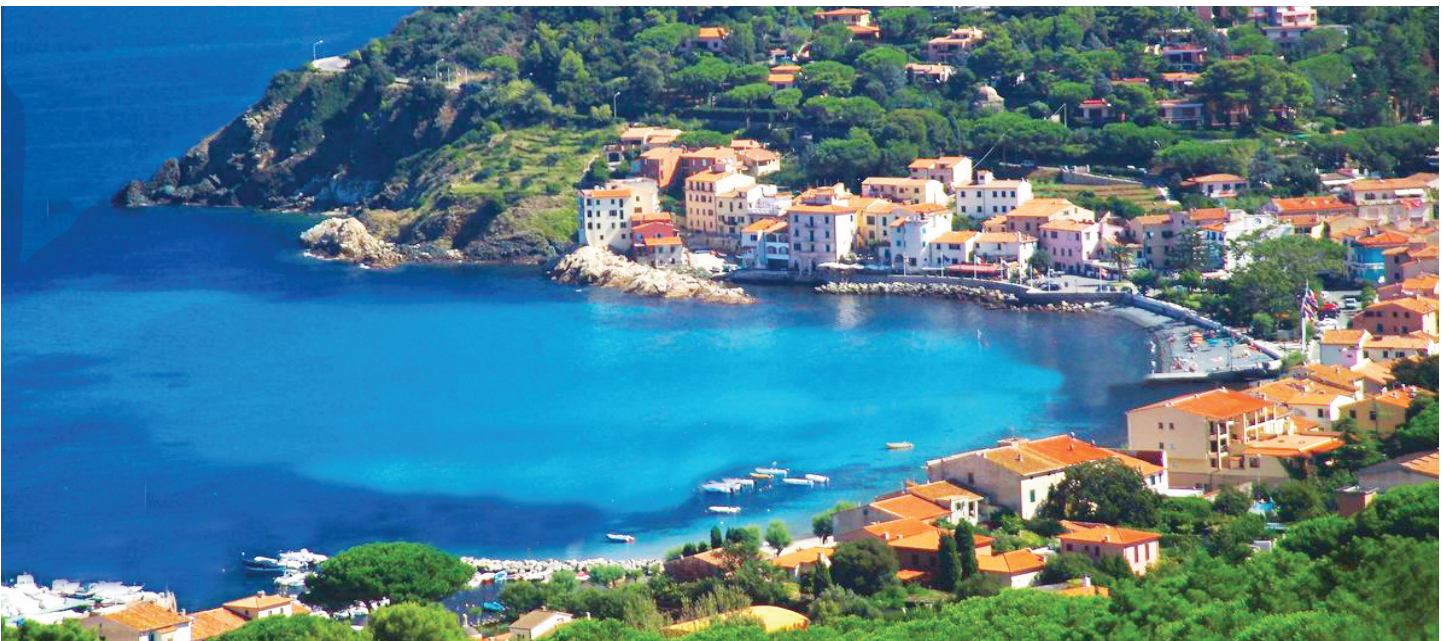
Isle of Elba: one of many picturesque villages

Sat 1 Jun 8.30 – Departure for Elba Island, via a modern freeway. 16.00 – Ferry boat to Elba. 17.30 – Arrival at the hotel. 19.30 – Dinner at the hotel (included).