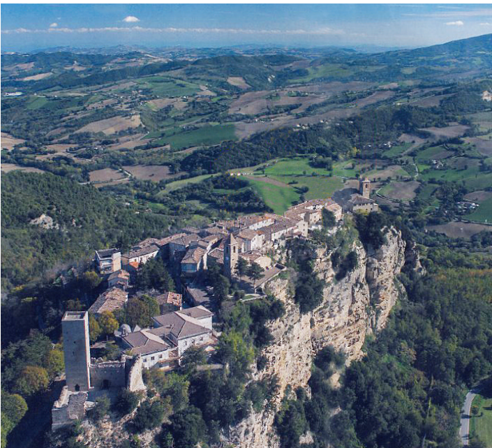
Montefalcone: a balcony over the Marche Region

Mon 13 May 09.30 – Sightseeing orientation in Macerata, covering the main architectural highlights of this historic town. Afternoon at leisure. 19.30 – Optional dinner.