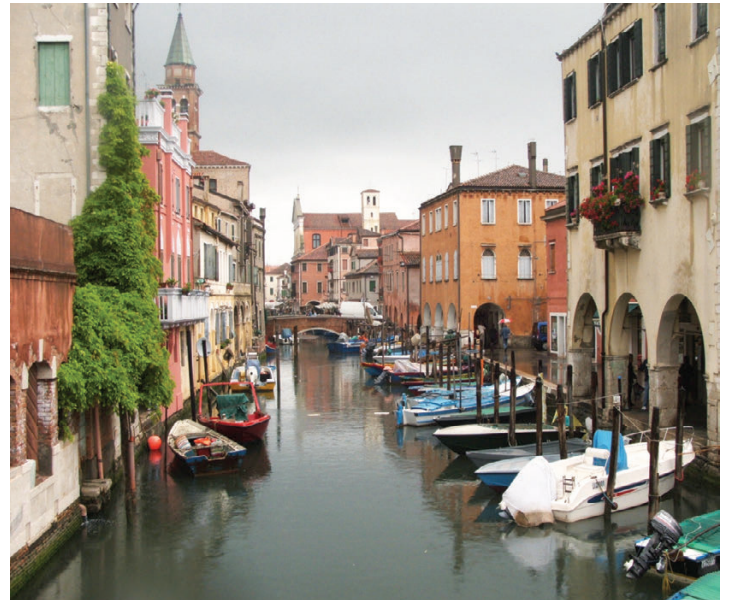
Chioggia is like Venice without millions of tourists

Sat 18 May 08.30 – Scenic drive through the picturesque hills south west of Ferrara, to the historic village of Montecucolo (870m), dominated by its amazing castle. 10.30 – Arrival, sightseeing and visit to the castle. 12.30 – Short drive to the town of Pavullo and visit to the Ducal Palace. 17.00 – Arrival in Ferrara. 19.30 – Optional dinner.