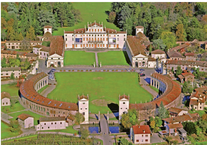
The Venetian Villa Manin

Fri 24 May 8.30 – Departure for Gardone, an upmarket elegant resort set on the banks of Lake Garda. On the way to Gardone stop at Villa Manin: the most splendid of the Venetian villas, built by the last Doge of Venice and dating back to the XVII century when the north east of Italy was part of the Republic of Venice. Local visit and lunch. 13.30 – Departure from Villa Manin. 17.00 – Arrival at Gardone. 19.30 – Dinner at the hotel (included).