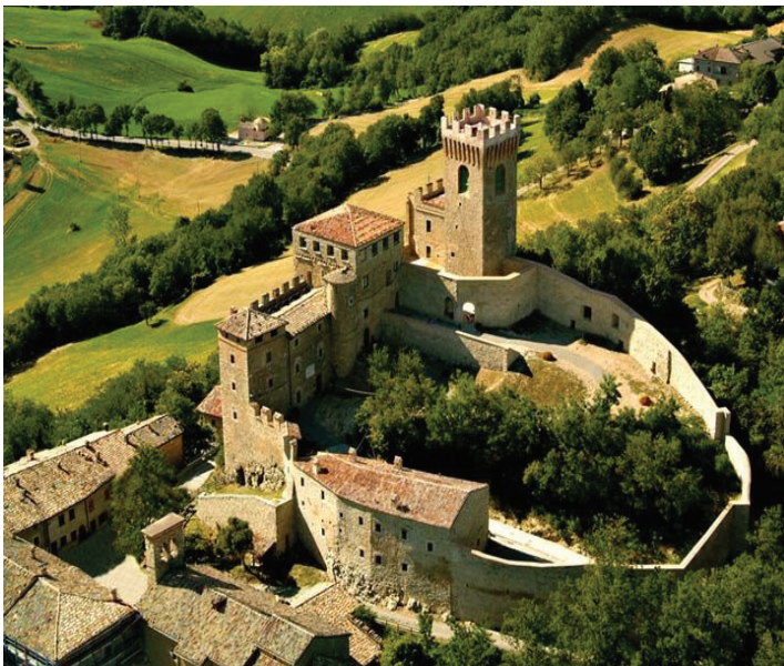
Montecucolo is overlooked by its castle

Fri 17 May 08.30 – Downtown orientation in Ferrara, covering the main architectural highlights of this historic city. Afternoon at leisure. 19.30 – Optional dinner.