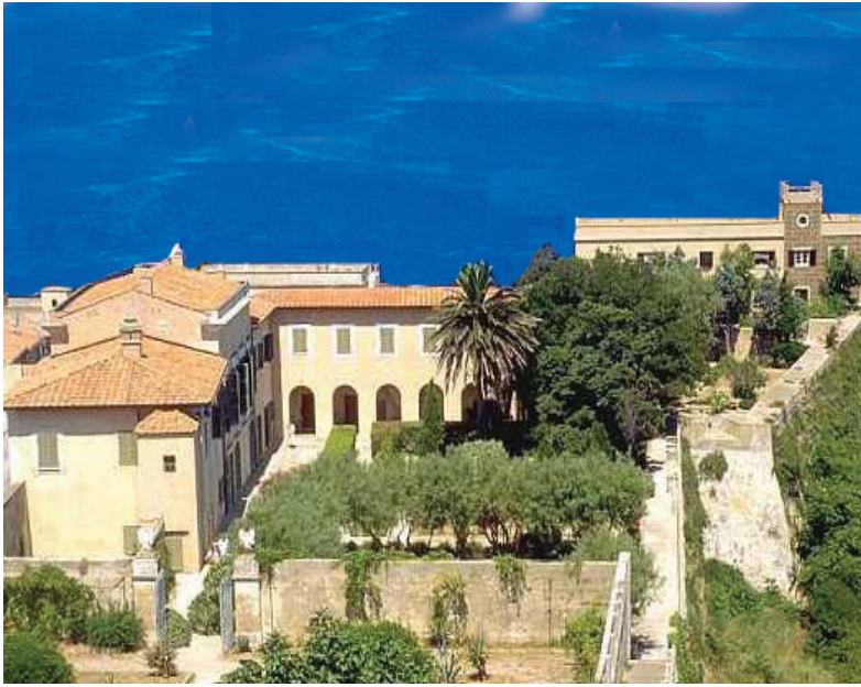
Napoleon's residence at the Isle of Elba

Sun 2 Jun 8.30 – Scenic drive along the Enfola peninsula and around the Bay of Portoferraio. Stop at Portoferraio, the island's capital. Visit to Napoleon's residence (Villa dei Mulini) and the medieval fortresses. 13.30 – Departure from parking area and return to hotel. 15.00 – Scenic drive to display centre of minerals and craftsmanship near Porto Azzurro. Optional little train through a mine displaying the exceptional variety of minerals to be found at Elba. 16.30 – Departure and return to hotel. 19.30 – Dinner at the hotel (included).