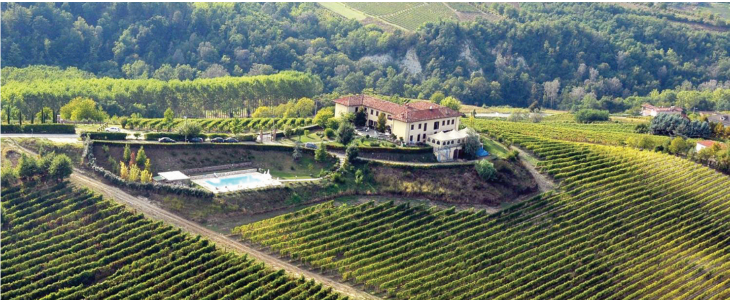
Afternoon refreshment at this charming country residence in the Monferrato district of Piedmont

Fri 31 May 8.30 – Departure for Asti, a famous city of the Piedmont Region, well renowned for its wine production. But it is also a gem of Piedmontese architecture and well worth a visit. 09.30 – Arrival at Asti, local orientation and time at leisure. 13.30 – Departure for a scenic drive through the Monferrato District of Piedmont with a refreshment stop in a charming setting. 17.30 – Arrival back in Alba. 19.30 – Optional dinner.