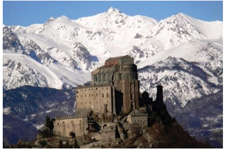
Sacra San Michele

Wed 29 May 8.30 – Orientation in Alba covering the main highlights and time at leisure. 15.00 – Very scenic drive, with a few stops, throughout the Langhe (a district of the Piemonte Region) famous for the picturesque hilly countryside, boasting vineyards and castles. The local wines are very upmarket and the Langhe are also famous for gastronomy. So much so that we end our drive in a spectacular restaurant with 10 delicate courses, complemented by quality wines (This dinner is included). 22.30 – Arrival back in Alba.