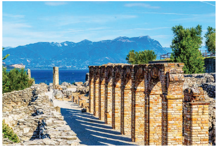
Sirmione, Lake Garda: The Scaligero Castle and the ruins of an old Roman Citadel

Sun 26 May 10.00 – Navigation to Sirmione which, since Roman times has been praised for its extraordinary beauty, due to its panoramic setting along a tiny picturesque peninsula. So much so that ancient Roman ruins are still prominent at the very tip of the peninsula. 11.30 – Arrival and local orientation along the peninsula from the castle to the Roman ruins. Time at leisure. 17.00 – Departure from Sirmione and return to Gardone. 19.30 – Optional dinner.