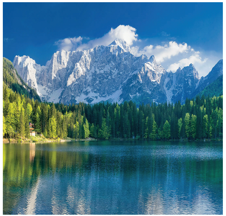
Eastern Alps, Friuli Region - Lake Fusine

Tue 21 May – 8.30 – Very scenic drive to Lake Sauris (1,000m), flanked by the pristine forests of the Alps. Stop at Tolmezzo: visit to the Museum of the Eastern Alps and time at leisure. 10.30 – Departure for Sauris and its lake stopping at the Chalet Riglarhaus (above the lake) for a special gastronomic lunch (included). After lunch we drive through a most spectacular pass to reach the picturesque and unspoilt Pesarina Valley flanked by the Dolomites. Sightseeing stop at the village of Pesariina famous for the great variety of clocks gracing its alleys as well as its heritage architecture. 17.00 – Arrival in Aplis 19.30 – Dinner at the hotel (included).