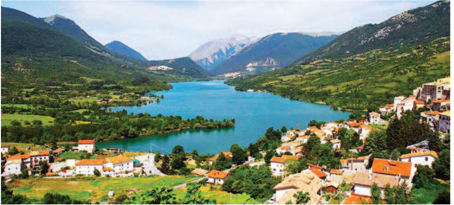
The village of Civitella Alfedena – Abruzzo National Park

Sun 2 Jul 07.30 – Arrival at Rome Airport. Departure for Civitella Alfedena, a picturesque mountain village (at 1,100m) surrounded by forests, in high position, above a scenic little lake. 14.30 – Arrival at the hotel. Afternoon at leisure. 19.30 – Dinner at the hotel (included).