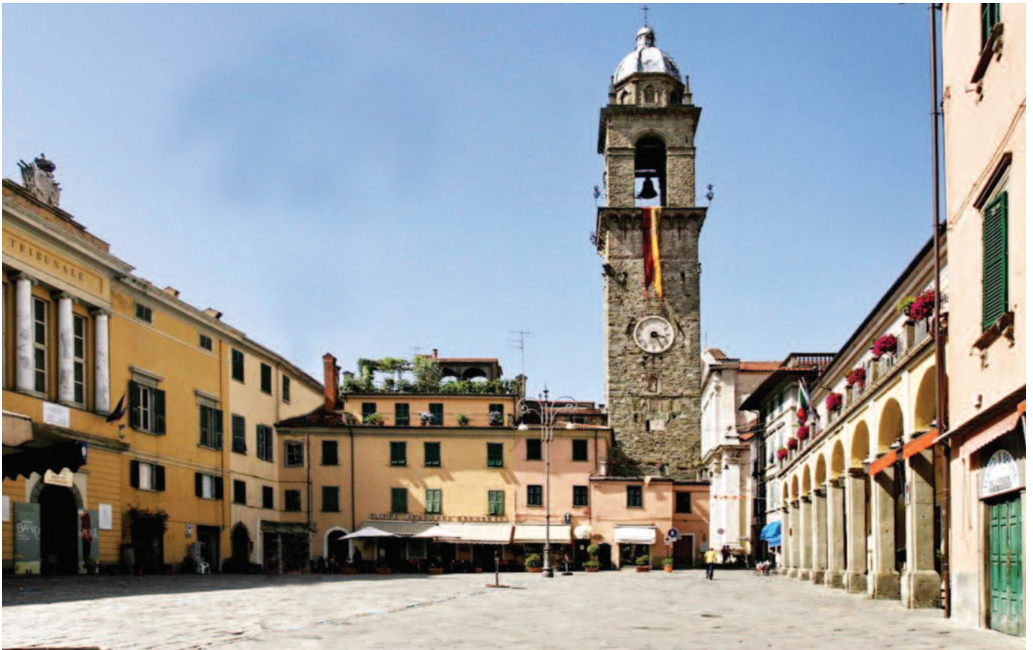
The historic town of Pontremoli lies set in a green valley on the northern tip of Tuscany

Sat 20 Jul 08.30 – Scenic drive across a couple of spectacular passes to the historic town of Pontremoli, set in a green lush valley of Northern Tuscany and renowned for its heritage architecture as well as its imposing medieval castle. 10.45 – Arrival in Pontremoli. Local orientation and time at leisure. 14.30 – Departure. 16.45 – Arrival back in St. Stefano d’Aveto. 19.30 – Dinner at the hotel (included).