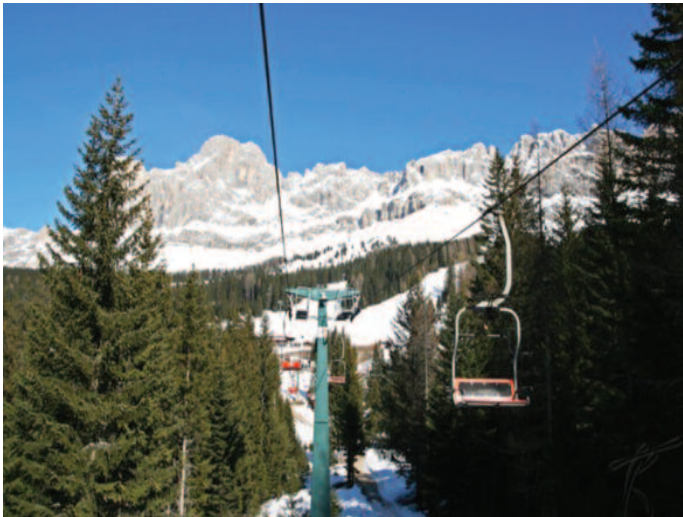
Chairlift at Mt. Cristallo

Thu 11 Jul 08.30 – Brief scenic walk through the picturesque old district of Sappada. Chairlift to a panoramic chalet at 2,000m with sweeping views of the Dolomites. Relax and enjoy. Go for a scenic walk. Lunch at the chalet or return to Sappada at time of your choice. 15.00 – Easy local scenic walk on the banks of a clear stream, flanked by the impressive vertical peaks of the Dolomites. 19.30 – Optional dinner.