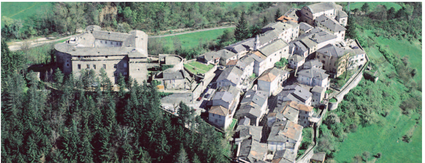
The heritage village of Compiano

Fri 19 Jul 08.30 – Departure for a scenic drive, north of St. Stefano d'Aveto, in the province of Parma, which before the unification of Italy in 1861, was a wealthy independent Grand Duchy with quite a few outstanding castles and luxurious residences. We have selected two of the most prominent castles in the district. First we visit the Bardi Castle which represents one of the most significant examples of military architecture in Northern Italy. After lunch in Bardi we drive to the Castle of Compiano which is most impressive not just for its powerful and imposing architecture but also for its elaborate inner decorations, frescoes and classic furniture. 17.00 – Arrival back at the hotel. 19.30 – Dinner at the hotel (included).