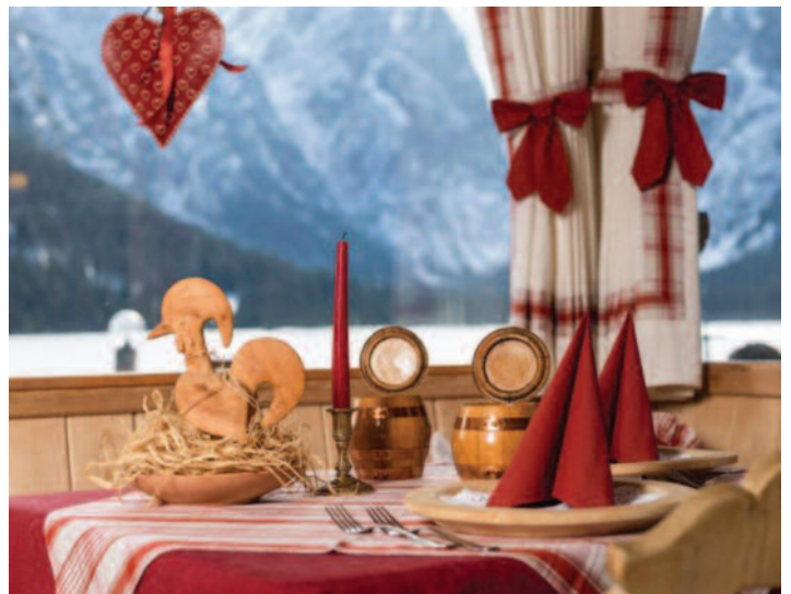
Lunch at Lake Dobbiaco – Dolomites

Sat 13 Jul 08.30 – Start of another spectacular day!! First stop is at Lake Misurina (1,800m) with a background of high Dolomitic peaks. Local sightseeing and easy scenic walk. Continuation to nearby Lake Antorno (1,900m). Then we drive downhill to Lake Dobbiaco (1,200m) for lunch. From Lake Dobbiaco we return to Sappada via alternative scenic route. 17.00 – Arrival in Sappada. 19.30 – Optional dinner.