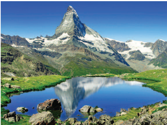
Mt. Matterhorn (4,478m) is half Italian half Swiss

Sat 13 Jul 08.30 – Start of another spectacular day!! First stop is at Lake Misurina (1,800m) with a background of high Dolomitic peaks. Local sightseeing and easy scenic walk. Continuation to nearby Lake Antorno (1,900m). Then we drive downhill to Lake Dobbiaco (1,200m) for lunch. From Lake Dobbiaco we return to Sappada via alternative scenic route. 17.00 – Arrival in Sappada. 19.30 – Optional dinner.