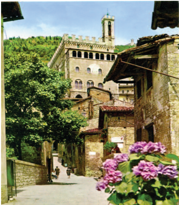
Gubbio – Umbria Region

Sun 7 Jul 08.30 – Local orientation in Poppi, covering the main highlights and time at leisure. 13.30 – Departure from Poppi for a scenic drive to the Eremo of Camaldoli (at 1,120m). Local visit and return to Poppi. 17.00 – Arrival at the hotel. 19.30 – Optional dinner.