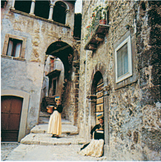
Costumes in Scanno - Abruzzo Region

Fri 5 Jul 08.30 – Scenic drive across high rising mountains to Scanno, a small picturesque town built on a mountain spur (at 1,100m) with an oriental flavour whose origins are still a mystery. On the way to Scanno we stop briefly at the scenic Pass of Godi (1,600m). Then it's downhill to Scanno. Local orientation and time at leisure. 13.30 – Departure from Scanno for a short drive to Lake Scanno. Local sightseeing and time at leisure. 15.00 – Departure from Lake Scanno. 17.00 – Arrival back in Civitella Alfedena. 19.30 – Dinner at the hotel (included).