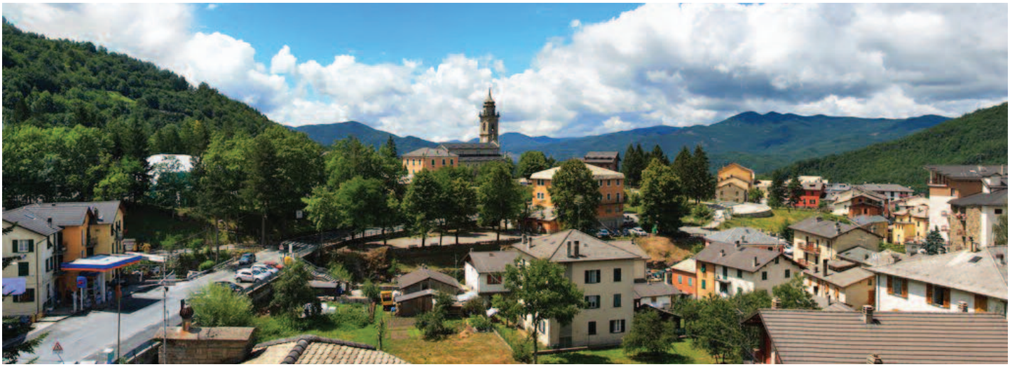
St. Stefano d'Aveto

Thu 18 Jul 08.30 – Departure for St. Stefano d'Aveto (at 1,000m) on the Appennini Mountain Range which, in this area borders on the shores of the Italian Riviera for its entire length. St. Stefano d'Aveto is a winter and summer resort with excellent facilities and historic features as well. 16.00 – Arrival in St. Stefano d'Aveto. 19.30 – Dinner at the hotel (included).