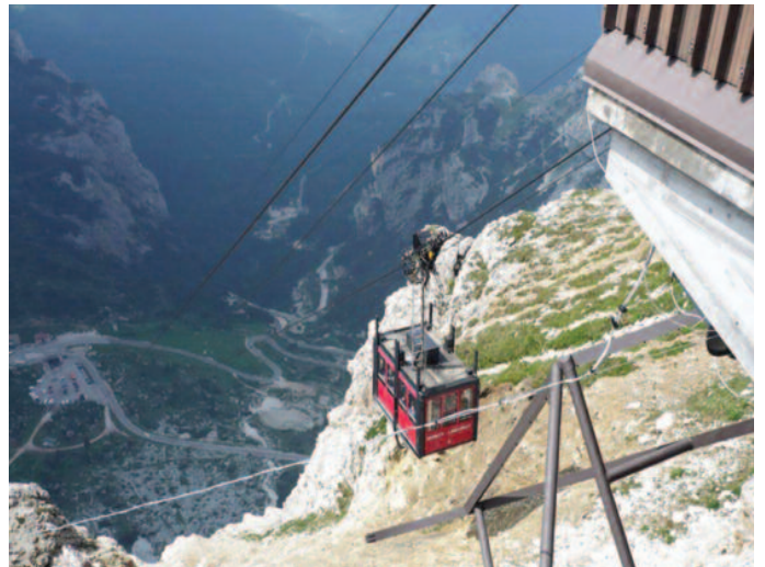
Cable car at Falzarego Pass – Dolomites

Fri 12 Jul 08.30 – Super spectacular drive into the heart of the Dolomites. At Mt. Cristallo a chairlift + cable car will take you to a chalet at 2,900m with breathtaking views. After descending from the chalet we continue to Cortina d'Ampezzo, the "Pearl of the Dolomites" at 1,200m for some sightseeing and lunch. We then drive up to the Falzarego Pass at 2,100m where a spectacular cable car will take you up to a panoramic chalet at 3,000m. And after this unforgettable "Grand Finale" we return to Sappada. 18.00 – Arrival back at the hotel. 19.30 – Optional dinner.