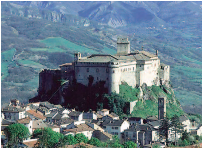
Castle of Bardi

Thu 18 Jul 08.30 – Departure for St. Stefano d'Aveto (at 1,000m) on the Appennini Mountain Range which, in this area borders on the shores of the Italian Riviera for its entire length. St. Stefano d'Aveto is a winter and summer resort with excellent facilities and historic features as well. 16.00 – Arrival in St. Stefano d'Aveto. 19.30 – Dinner at the hotel (included).