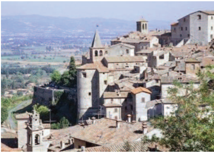
Anghiari – Eastern Tuscany