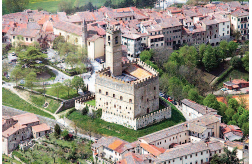
Poppi – Eastern Tuscany

Sat 6 Jul 08.30 – Departure for Poppi, located in a panoramic position on top of a scenic hill (at 500m) in the Eastern Appennini mountain range of Tuscany. This picturesque town is still in pristine condition surrounded by an impeccable circle of medieval walls and has been miraculously by passed by the herds of tourists who invade Tuscany. 17.00 – Arrival in Poppi. 19.30 – Dinner at the hotel restaurant (included).