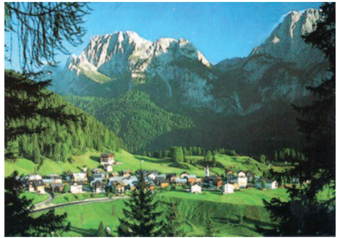
Sappada – Dolomites

Tue 9 Jul 08.30 – Panoramic circuit of the charming eastern countryside of Tuscany boasting impressive highlights: Caprese-Michelangelo on a hilltop (at 650m) features the house where Michelangelo was born; Anghiari, a lovely small town built on a hillside and still circled by medieval walls. 15.00 – Arrival in Poppi. 16.00 – Departure for the nearby Castle of Romena, located on a spectacular peak at 650m overlooking a pretty traditional Tuscan landscape. It dates back to the 10th century. 18.00 – Arrival back in Poppi. 19.30 – Optional dinner.