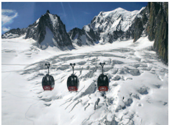
Cable cars over the glaciers of Mount Blanc

Sun 14 Jul 08.30 – Departure for Aosta (at 600m). Aosta is an historic town of ancient Roman origins and it's the capital of the Region of Valle d'Aosta. This is mostly a freeway journey. 17.30 – Arrival at Aosta. 19.30 – Local dinner (included).