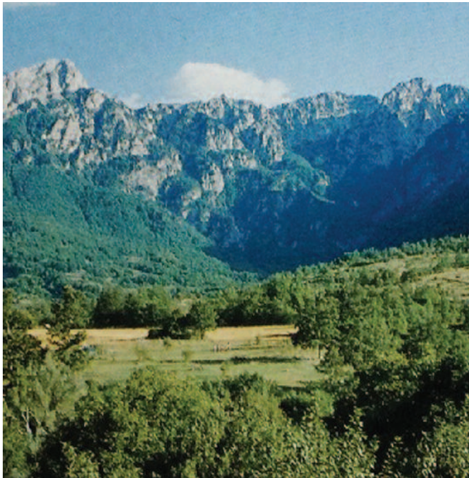
The Chamois Valley – Abruzzo National Park

Wed 3 Jul 09.30 – Scenic drive to Pescasseroli, an ancient village in the heart of the Abruzzo National Park, where bears, chamois and wolves still live in the wilderness. Relax and stroll in Pescasseroli. 11.00 – Visit to National Park Centre. 13.00 – Return to hotel. 15.00 – Excursion to the Chamois Valley. Scenic drive + easy scenic walk. 17.30 – Departure for Civitella Alfedena. 19.30 – Optional dinner in picturesque local restaurant.