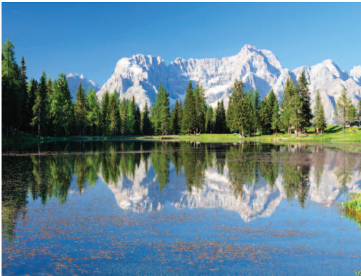
Lake Antorno – Dolomites