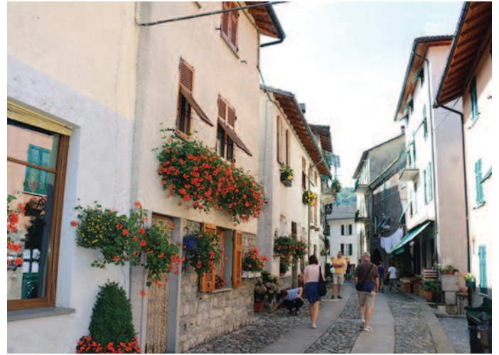
Typical alley at St. Stefano d'Aveto

Fri 19 Jul 08.30 – Departure for a scenic drive, north of St. Stefano d'Aveto, in the province of Parma, which before the unification of Italy in 1861, was a wealthy independent Grand Duchy with quite a few outstanding castles and luxurious residences. We have selected two of the most prominent castles in the district. First we visit the Bardi Castle which represents one of the most significant examples of military architecture in Northern Italy. After lunch in Bardi we drive to the Castle of Compiano which is most impressive not just for its powerful and imposing architecture but also for its elaborate inner decorations, frescoes and classic furniture. 17.00 – Arrival back at the hotel. 19.30 – Dinner at the hotel (included).