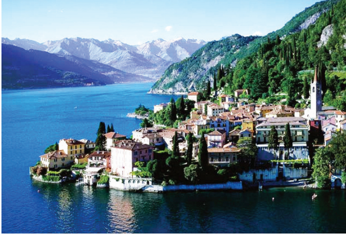
Lecco on the banks of Lake Como

Tue 18 Jun 08.30 – Departure for Lecco (Lake Como). This is a freeway journey. 17.30 – Arrival in Lecco. 19.30 – Dinner in local restaurant (included).