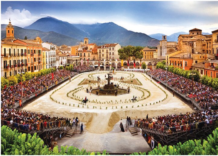
The historic main square of Sulmona - Abruzzo Region

Tue 11 Jun 09.30 – Orientation in Sulmona covering the main architectural highlights of this historic town. Afternoon at leisure. 19.30 – Optional dinner.