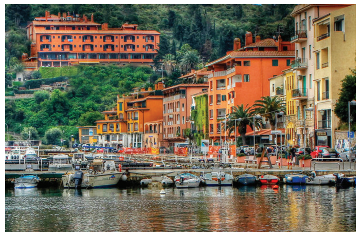
Our scenic hotel at Porto Ercole (top left)