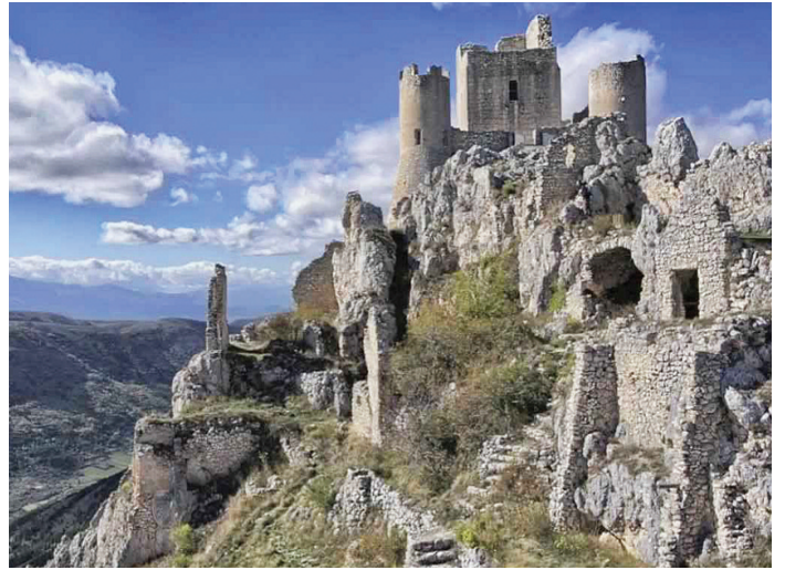
Rocca Calascio – Abruzzo Region

Wed 12 Jun 08.30 – Scenic drive into the heart of the Abruzzo region, going through the Appennini Mountain Range which in this area display a very rugged pristine nature. What makes these mountains unique is the historical heritage and picturesque medieval villages which seem to belong to another age and make them a world apart from the modern architecture of the Alpine resorts. This is a full day fascinating journey. We stop at Rocca di Mezzo (1,400m) and then drive through the spectacular Sirente-Velino Regional Park. We continue to Santo Stefano di Sessanio (1,200m) for a local visit and time for lunch. On the way back, stop at Calascio renowned for its imposing castle in a panoramic spot with an impressive back-drop of high rising mountains. 17.00 – Arrival in Sulmona. 19.30 – Optional dinner.