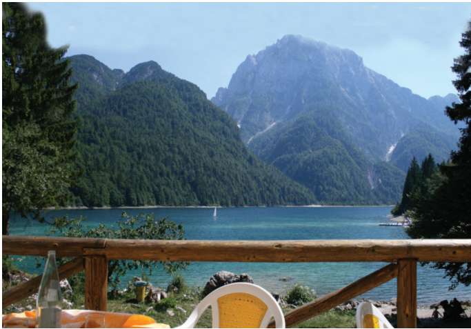
Our lunch stop at Lake Predil

Tue 25 Jun 08.30 – Spectacular drive to Malga Montasio, a high altitude summer cattle station (at 1,700m) where visitors can enjoy artisan cheese and Alpine specialties. 10.30 – Arrival, local snack and scenic walk. Continuation to Lake Predil (at 950m) for lunch in a beautiful spot. 17.00 – Arrival at Forni di Sopra. 19.30 – Dinner at the hotel (included).