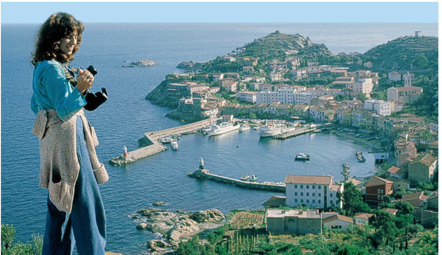
The picturesque little harbour of Giglio Island

Fri 14 Jun 08.30 – Departure for Porto Ercole. Stop at Trevignano for lunch on the banks of Lake Bracciano. 16.45 – Arrival in Porto Ercole. Dinner at the hotel's panoramic restaurant (included).