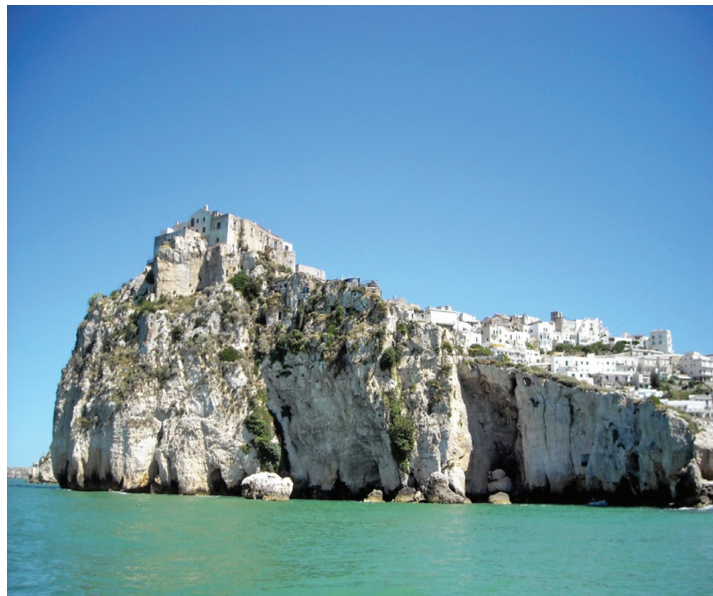
Peschici and its fortress on a cliff

Sat 8 Jun 08.30 – Spectacular steep climb with great scenic views from sea level to the historic village of Mount St. Angelo built on a cliff at 800m. Local sightseeing and time at leisure in Mt. St. Angelo. 13.30 – Return to hotel. 19.30 – Dinner at the hotel (included).