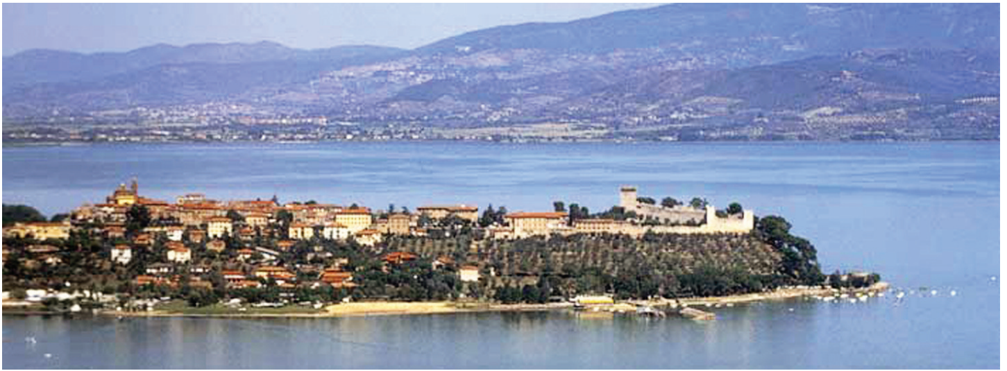
Castiglione del Lago at Lake Trasimeno

Sat 29 Jun 08.30 – Departure for Castiglione del Lago, an impressive small town set in a panoramic position on a rocky promontory overlooking Lake Trasimeno. 9.30 – Arrival and local sightseeing: most prominent are the Ducal Palace and the Castle. Time at leisure. 11.15 – Departure for Tuoro along the lake shore and taxi boat to the island of Maggiore, renowned for its ancient medieval village in picturesque setting. 14.30 – Departure from the island. 16.00 – Arrival back in Cortona. 19.30 – Optional dinner.