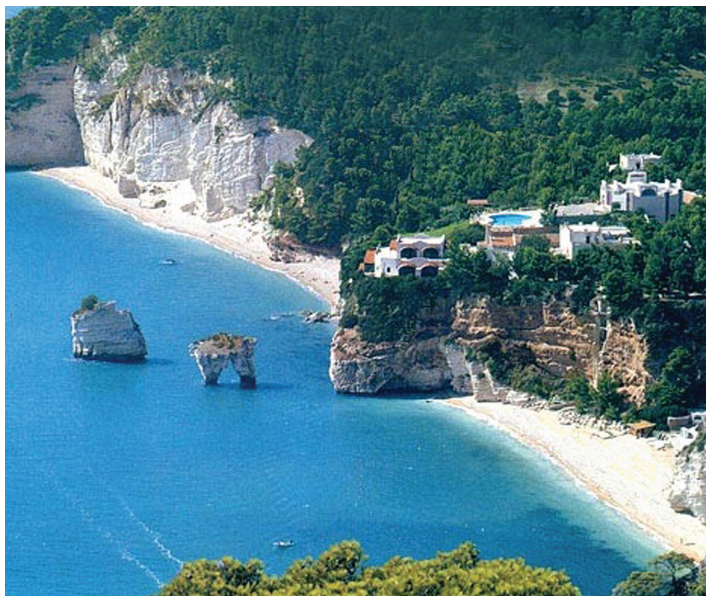
Our hotel overlooking Baia delle Zagare

Fri 7 Jun – Morning at leisure in the beautiful hotel park. 14.00 – Scenic navigation along the beautiful coastline of the Gargano promontory, dotted with many picturesque grottos. 19.30 – Dinner at the hotel (included).