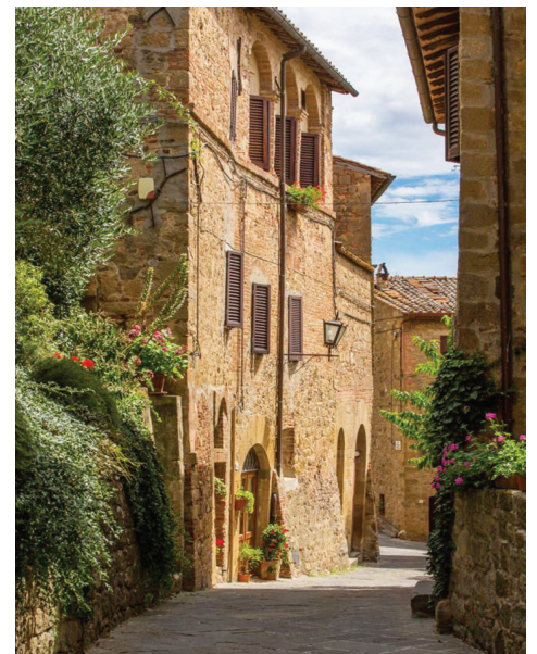
Traditional architecture in Tuscany: Bagno Vignoni (left) and Monticchiello (right)

Fri 28 Jun 08.30 – Scenic drive through some of the most picturesque countrysides of Tuscany. First we stop at Monticchiello. Then we continue through a very undulated green landscape dotted with traditional Tuscan farm houses, until we reach Bagno Vignoni set on a panoramic spot. Local sightseeing and time at leisure. 14.00 – Departure from Bagno Vignoni. 16.30 – Arrival in Cortona. 19.30 – Optional dinner.