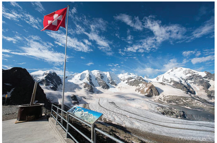
Cable car to the spectacular Chalet/lookout of the Bernina Glacier - Switzerland

Thu 20 Jun 08.30 – Departure for a highly spectacular drive through the Swiss Alps, climbing to the Maloja Pass (1,800m) and continuing along a beautiful plateau flanked by pretty lakes and snowy peaks to be followed by a scenic drive to a cable car station. The optional cable car can take you up to a chalet/look out at 3,000m with sweeping views of the Bernina Glacier. Continuation to the Bernina Pass (2,300m). Spectacular descent to Tirano (Italy) and then westward to Lake Como. 17.00 – Arrival in Lecco. 19.30 – Optional dinner.