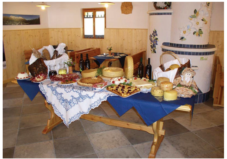
High altitude pastures (at 1,700m) of Montasio Cattle Station and a display of its locally produced specialties