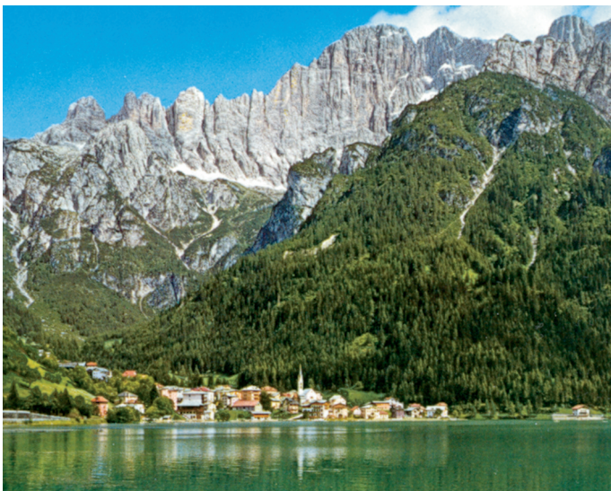
Alleghe – Dolomites

Sun 23 Jun 08.30 – Scenic drive to Mt. Lussari. 10.00 – Stop at Malborghetto and local sightseeing. 11.00 – Short drive to Mt. Lussari and optional cable car to the top of the mountain (1,790m). Local sightseeing, lunch and scenic walk. 14.30 – Cable car back. 17.00 – Arrival at Forni di Sopra. 19.30 – Dinner at the hotel (included).