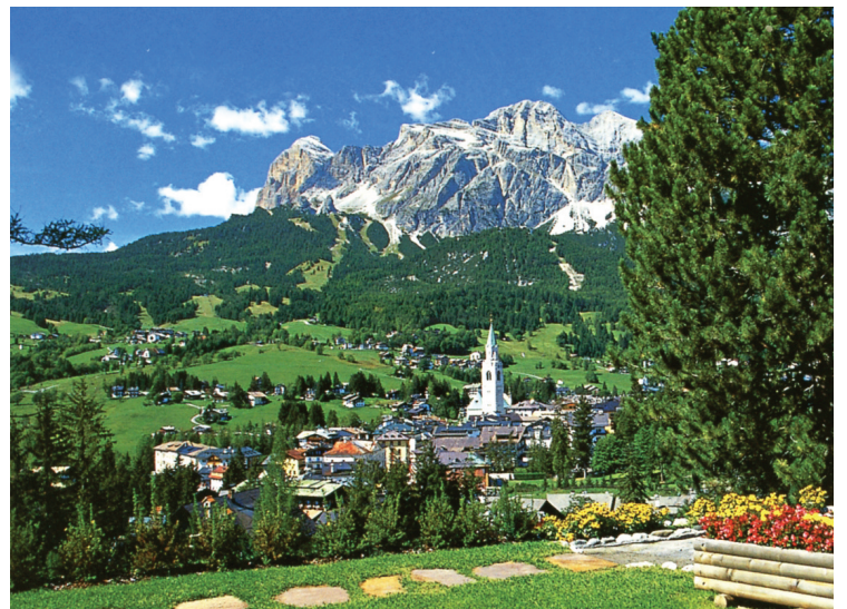
Cortina - The Pearl of the Dolomites

Mon 24 Jun 08.30 – Super spectacular drive through some of the most famous landscapes and passes of the Dolomites. Stop at Cortina, the Pearl of the Dolomites for a brief visit. Continuation along the splendid Giau Pass (2,236m) and then downhill to Lake Alleghe. Local lunch followed by a scenic walk on the banks of the lake. 14.30 – Departure and return via Falzarego Pass (2,105m). 17.30 – Arrival at Forni di Sopra. 19.30 – Dinner at the hotel (included).