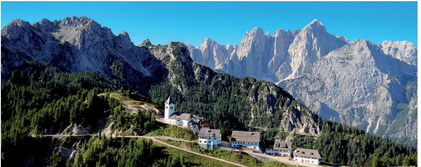
Mount Lussari can only be reached by cable car.

Local orientation in Trento and time at leisure. Amongst the main attractions available there is also a cable car which climbs to 600m boasting a sweeping view of the city and surrounding Alps. 13.30 – Departure from Trento. 17.30 – Arrival at Forni di Sopra. 19.30 – Dinner at the hotel (included).