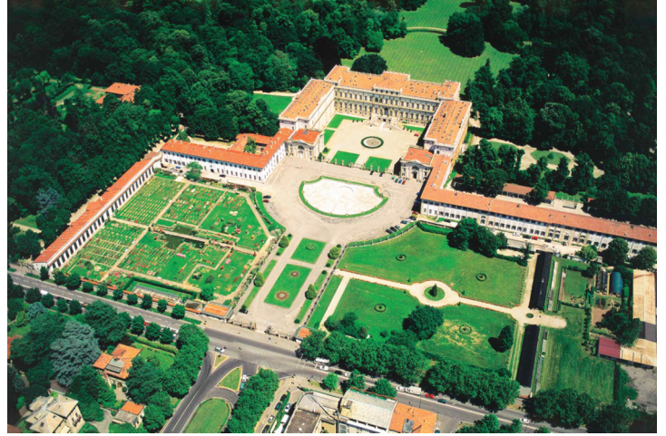
Monza: the Royal Palace

Wed 19 Jun 08.30 – Short railway journey (30km) to Monza, renowned for its historic elegant architecture as well as the Royal Palace built in the 18th century by Ferdinand of Hapsburg, Archduke of Austria. The Palace also boasts a beautiful park. Guided orientation in Monza. Time at leisure to enjoy the downtown attractions and visit the Royal Palace. 16.00 – Train back to Lecco. 19.30 – Optional dinner.