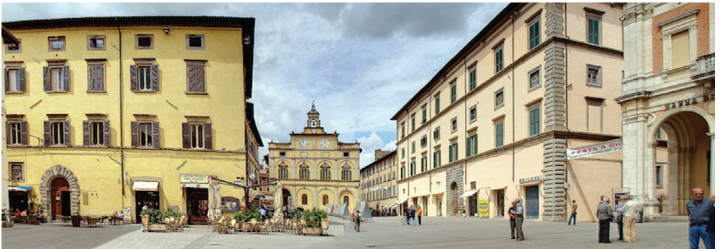
Cittá di Castello

Mon 22 Apr 08.30 – Scenic drive to the Gran Sasso National Park, which encompasses the highest peaks in Central Italy reaching a top of 3,000m. What makes this park very picturesque are the lovely medieval villages which grace the landscape and date back many centuries before the Park was established. First we stop at Campotosto, on the banks of the lake at 1,400m with the background of the Gran Sasso Mountain Range. Then we continue along a scenic road to the village of Castelli, famous in the Abruzzo Region for its ceramic tradition. Lunch and sightseeing at Castelli. 17.00 – Arrival in Rieti. 19.30 – Optional dinner.