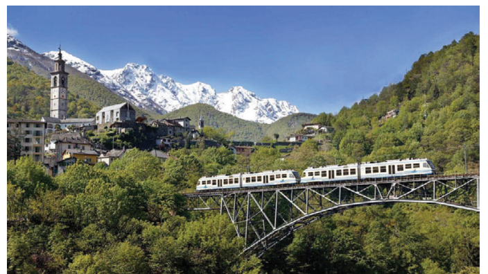
A scenic train crosses the Alps to Locarno in Switzerland

Thu 2 May 09.30 – Departure from Domodossola, boarding a scenic train travelling across Italian and Swiss Alps to reach Locarno on the banks of the Swiss northern part of Lake Maggiore. 11.20 – Arrival, guided orientation and time at leisure. Optional cable car. 14.50 – Departure from Locarno. 16.40 – Arrival in Domodossola. 19.30 – Optional dinner.