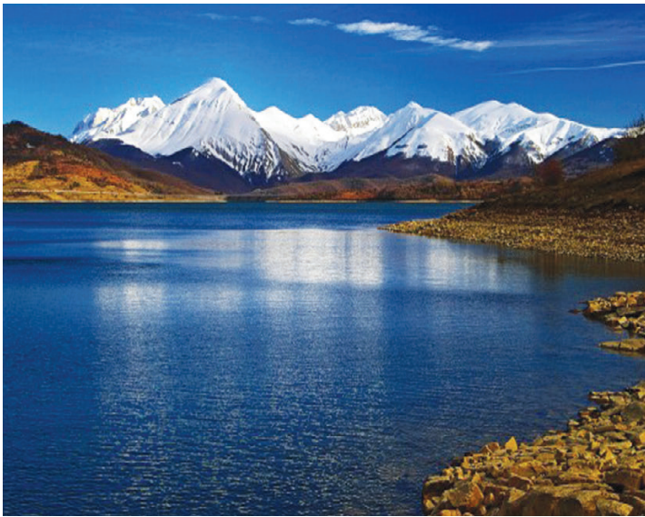
Gran Sasso National Park - Lake Campotosto