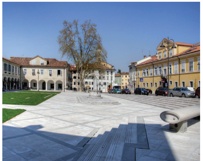
Gorizia - St. Antonio Square and our hotel on the right

Fri 26 Apr 08.30 – Departure for San Marino, the oldest small republic in Europe. It rises at 750m on the steep cusp of Mt. Titano and it dates back to the 11th century. The access is obviously difficult, but a modern cable car will enable us to get to San Marino easily. 10.00 – Arrival and local orientation. Time at leisure. 13.30 – Departure from San Marino. On the way back we stop at Gradara, a fascinating small medieval town featuring an impeccable pristine architecture. 17.00 – Arrival back in Cesena. 19.30 – Optional dinner. Sat 27 Apr 08.30 – Departure for Gorizia, a very elegant city which has been part of the Austrian Empire until a century ago. Austrian influence is still evident in the city architecture. 13.00 – Arrival in Gorizia. 15.00 – Local orientation covering the main architectural highlights and the local castle. 19.30 – Dinner in local restaurant (included).