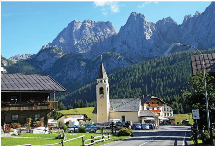
Sappada - Dolomites

Mon 29 Apr 08.30 – Departure by train to Trieste, a major elegant city by the sea. 09.30 – Arrival and local orientation covering the main architectural highlights, including Trieste's panoramic castle. Time at leisure with plenty of options to choose from. 17.00 – Departure from Trieste. 19.30 – Optional dinner.