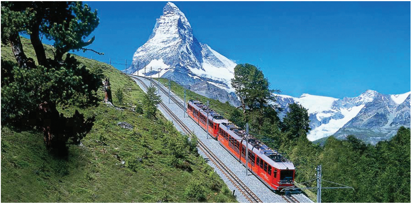
A spectacular Swiss cog-train climbs from Zermatt (1,600m) to 3,089m at the foot of the Matterhorn (peak of 4,478m)

Fri 3 May 08.30 – Departure by train for Zermatt (1,600m) in Switzerland. Train connection in Visp and arrival in Zermatt at 11.15. Time at leisure in this famous resort and three very scenic options: 1) Cog-train to Cornergrat (3,089m) at the foot of the Matterhorn (peak of 4,478m); 2) Cable car to Matterhorn Glacier at 3,883m; 3) Funicular to Sunnegga at 2,300m. 16.30 – Departure from Zermatt arriving in Visp at 17.45. Free time in Visp (local dinner if you wish). 19.30 – Train to Domodossola. 20.10 – Arrival in Domodossola. 20.30 – Optional dinner.