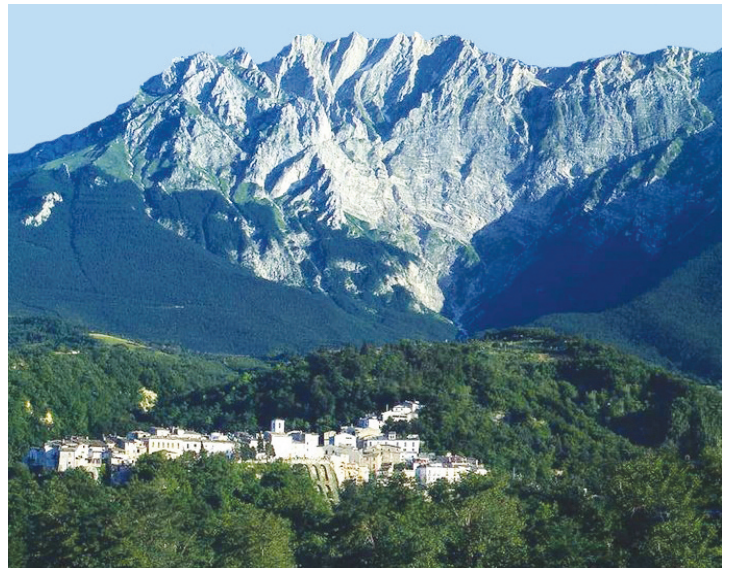
The town of Castelli - Abruzzo Region

Mon 22 Apr 08.30 – Scenic drive to the Gran Sasso National Park, which encompasses the highest peaks in Central Italy reaching a top of 3,000m. What makes this park very picturesque are the lovely medieval villages which grace the landscape and date back many centuries before the Park was established. First we stop at Campotosto, on the banks of the lake at 1,400m with the background of the Gran Sasso Mountain Range. Then we continue along a scenic road to the village of Castelli, famous in the Abruzzo Region for its ceramic tradition. Lunch and sightseeing at Castelli. 17.00 – Arrival in Rieti. 19.30 – Optional dinner.