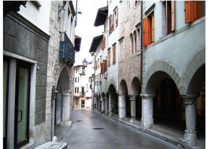
An alley in Gemona

Tue 30 Apr 08.30 – Scenic drive to Sappada (1,200m) in the heart of the Eastern Dolomites 10.30 – Arrival in Sappada. Easy scenic walk along the banks of a crystal clear stream, flanked by the spectacular vertical walls of the Dolomites. After lunch we drive south to the historic town of Gemona. Local orientation and some time at leisure. 17.00 – Arrival back in Gorizia. 19.30 – Optional dinner.