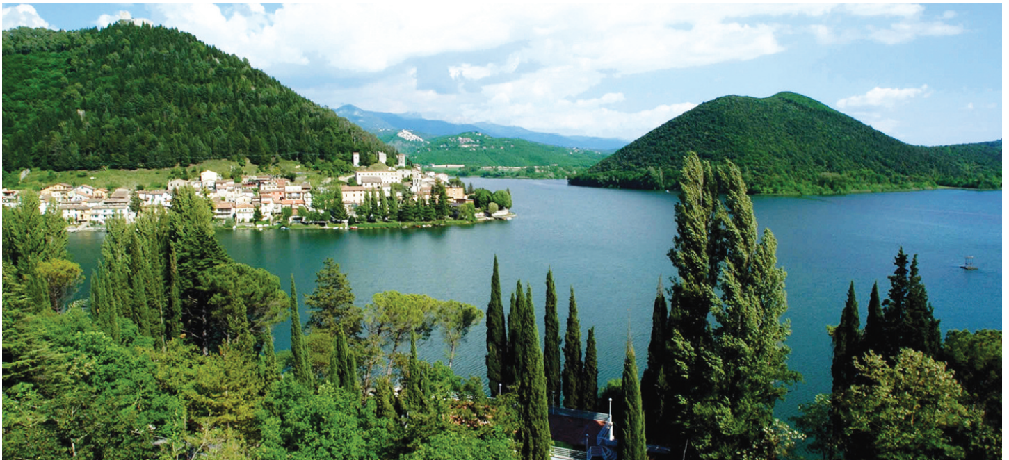
The serene village of Piediluco on the banks of its lake

Fri 19 Apr 07.30 – Arrival at Rome Airport. Departure by coach to Rieti (400m): a well preserved medieval town in a high position on top of a hill flanked by snowy peaks. 11.00 – Arrival at the hotel. 15.00 – Brief walking orientation downtown. 19.30 – Local dinner (included).