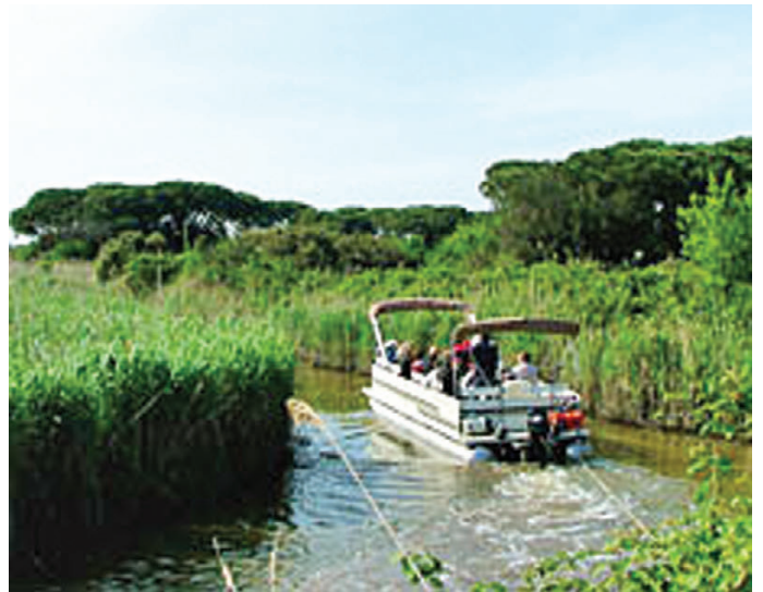
Town of Comacchio and our exclusive navigation in the nearby Regional Park of the Delta of the River Po

Thu 25 Apr 08.30 – Departure for the town of Comacchio, graced by a network of picturesque canals. 10.00 – Arrival, local sightseeing and time at leisure. 11.30 – Continuation on a scenic road to River Po Delta Regional Park. Lunch in beautiful setting. 14.00 – Local navigation by exclusive boat along the untouched canals of the Delta of River Po. 17.30 – Arrival in Cesena. 19.30 – Optional dinner.