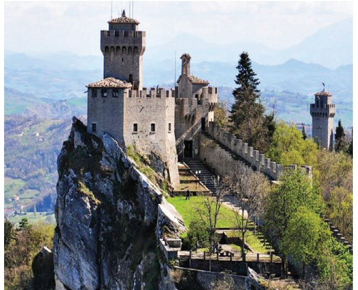
Republic of San Marino: The Government Palace and the fortification system

Fri 26 Apr 08.30 – Departure for San Marino, the oldest small republic in Europe. It rises at 750m on the steep cusp of Mt. Titano and it dates back to the 11th century. The access is obviously difficult, but a modern cable car will enable us to get to San Marino easily. 10.00 – Arrival and local orientation. Time at leisure. 13.30 – Departure from San Marino. On the way back we stop at Gradara, a fascinating small medieval town featuring an impeccable pristine architecture. 17.00 – Arrival back in Cesena. 19.30 – Optional dinner. Sat 27 Apr 08.30 – Departure for Gorizia, a very elegant city which has been part of the Austrian Empire until a century ago. Austrian influence is still evident in the city architecture. 13.00 – Arrival in Gorizia. 15.00 – Local orientation covering the main architectural highlights and the local castle. 19.30 – Dinner in local restaurant (included).