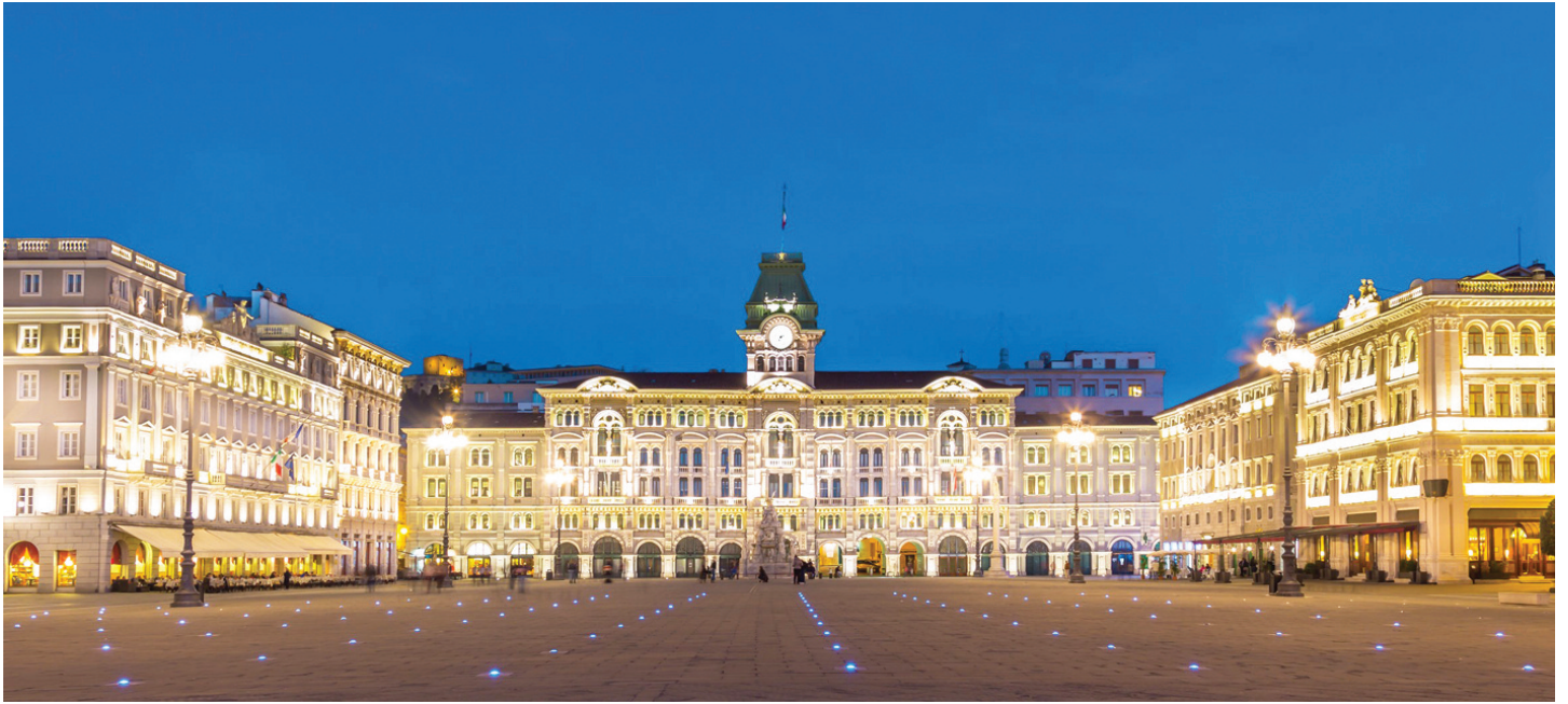
Trieste's main city square is in prime seaside location

Sun 28 Apr – Morning at leisure in Gorizia. 13.30 – Departure for Miramare Castle, This sumptuous castle was developed by Maximilian of Hapsburg, heir to the throne of Austria in the 19th century. 14.30 – Arrival and local visit. The castle also boasts a beautiful park. 16.00 – Departure for Gorizia. 19.30 – Optional dinner.